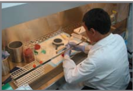
CBS2 staff member preparing a laboratory training site

Center for Biological Safety and Security ( CBS2 )